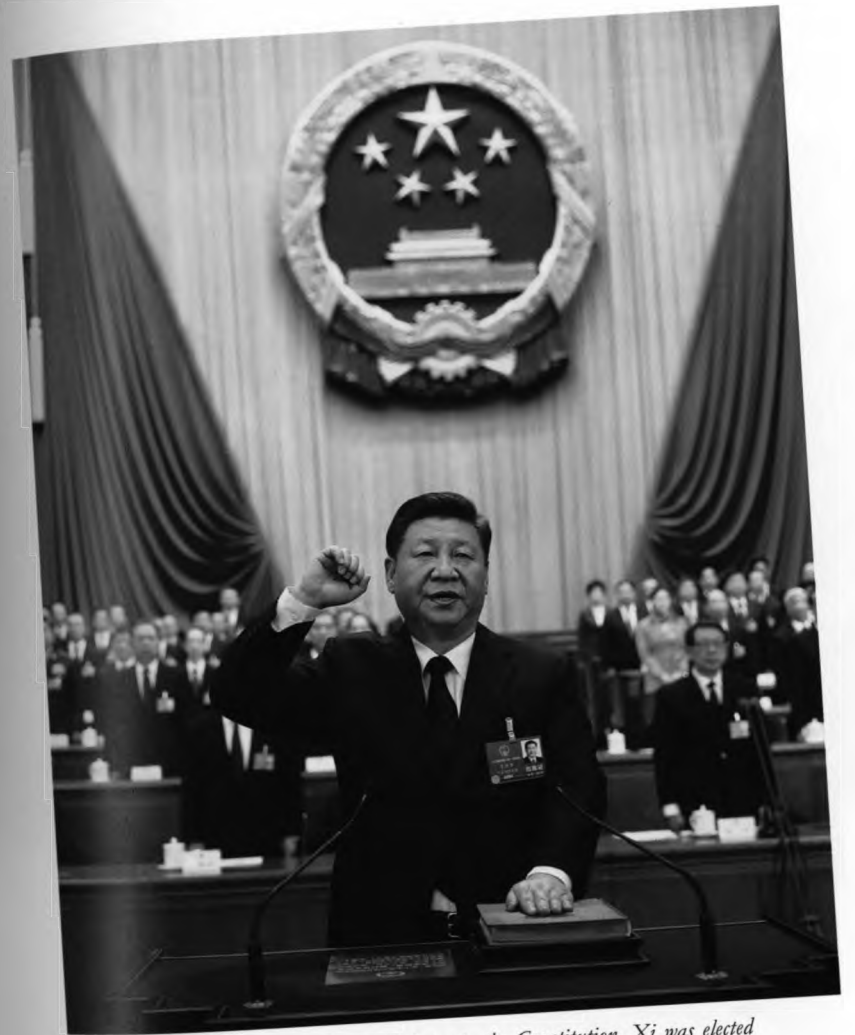
Taking a public oath of allegiance to the Constitution. Xi was elected president of the PRC and chairman of the Central Military Commission of the PRC at the First Session of the 13th National People's Congress, March 17, 2018.