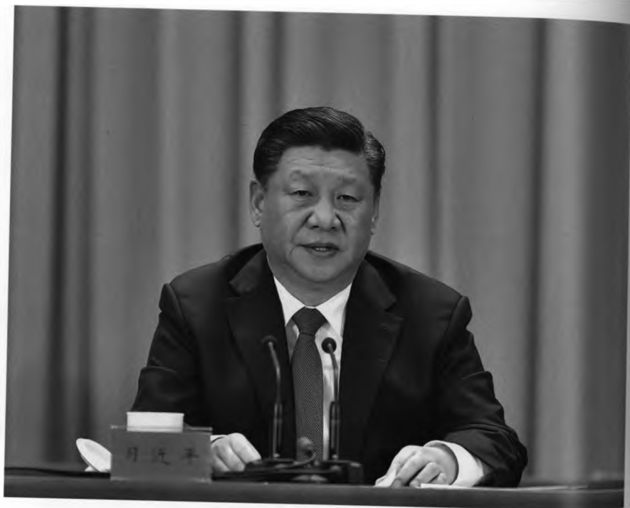
Delivering a speech in the Great Hall of the People in Beijing, at the meeting marking the 40th anniversary of the release of the Message to Compatriots in Taiwan, January 2, 2019.