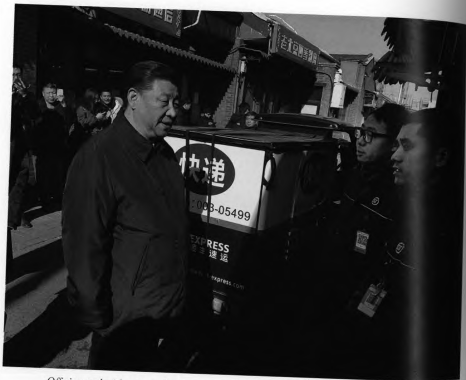
Offering good wishes to couriers in Shitou Alley in central Beijing, during a visit to extend New Year greetings to local residents in the lead-up to the Chinese Spring Festival, February 1, 2019.