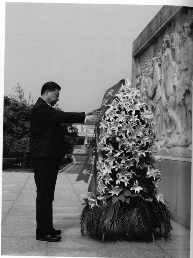
Paying tribute at a monument marking the departure of the Long March of the Central Red Army in Yudu County, Jiangxi Province, May 20, 2019, prior to the launch of the Aspiration and Mission education campaign by the CPC Central Committee.