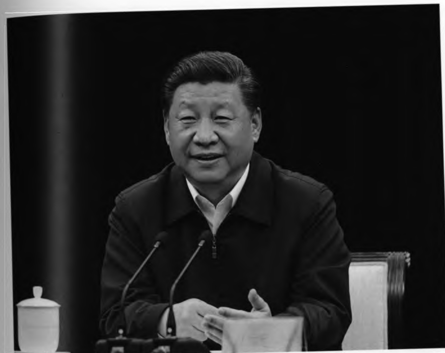
Presiding over the Seminar on Promoting the Rise of Central China in Nanchang, during his inspection tour of Jiangxi Province, May 21, 2019. Xi listened to work reports from officials of local authorities and central departments and made a speech.