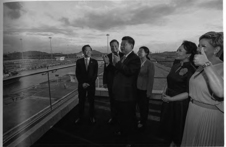
Xi and his wife, Peng Liyuan, on a visit to the new locks of the Panama Canal, together with Panamanian President Juan Carlos Varela and his wife, Lorena Castillo Garcia, in Panama City, December 3, 2018.