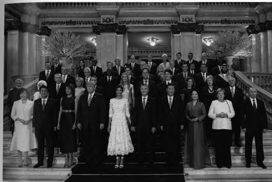
Xi and his wife, Peng Liyuan, together with heads of delegations for the 13th G20 Summit and their spouses in Buenos Aires, Argentina, November 30, 2018.