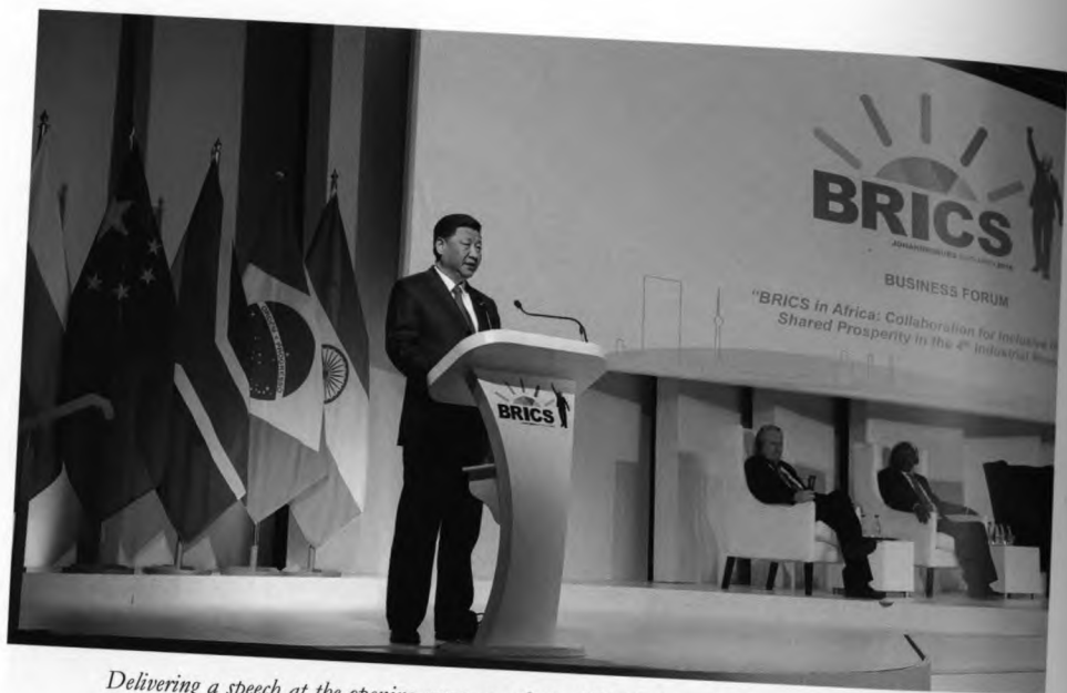
Delivering a speech at the opening ceremony of the BRICS Business Forum, July 25, 2018, during the 10th BRICS Summit in Johannesburg, South Africa.