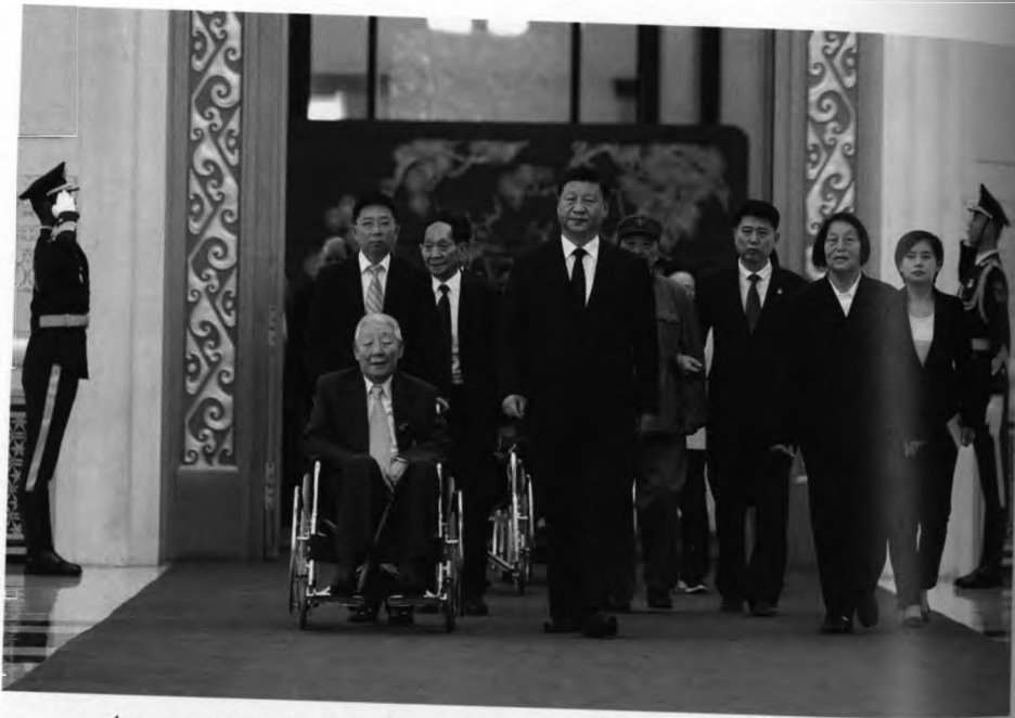
Accompanying awardees to the presentation ceremony for national medals and honorary titles of the People's Republic of China in the Great Hall of the People, September 29, 2019.