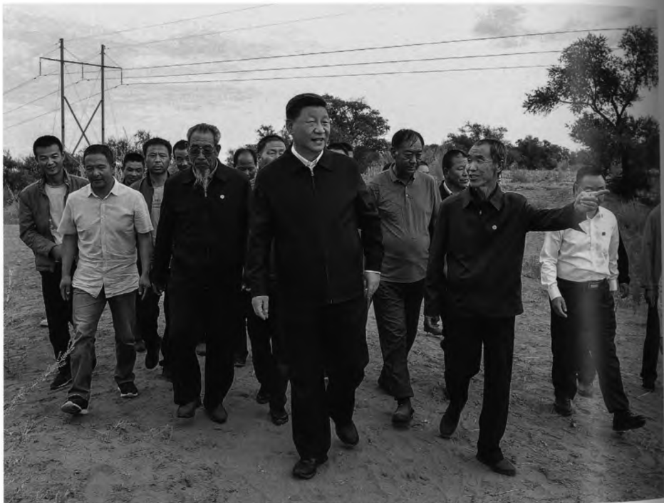
Inspecting the Babusba Forest Farm in Wuwei City, Gansu Province, August 21, 2019. Xi heard reports about the city's initiatives to prevent sand encroachment and control desertification, and was told of the afforestation work carried out by six local residents over three generations.