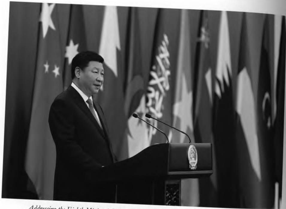
Addressing the Eighth Ministerial Conference of the China-Arab States Cooperation Forum at the opening ceremony in Beijing, July 10, 2018.