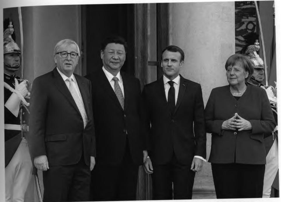
Meeting with French President Emmanuel Macron, German Chancellor Angela Merkel, and European Commission President Jean-Claude Juncker at the closing ceremony of the Seminar on Global Governance co-hosted by China and France in Paris, March 26, 2019.