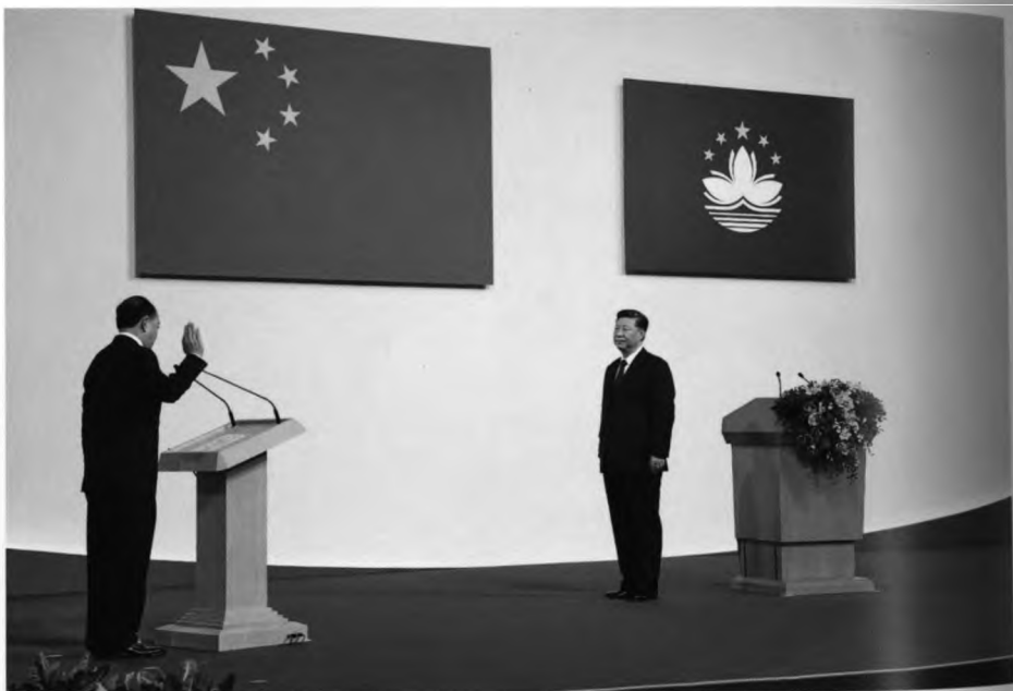
Presiding over the swearing-in ceremony of Ho Iat Seng as the fifth-term chief executive of the Macao Special Administrative Region, December 20, 2019. Xi delivered a speech at the gathering in the Macao East Asian Games Dome to celebrate the 20th anniversary of Macao's return to the motherland and the inauguration of its fifth-term government.