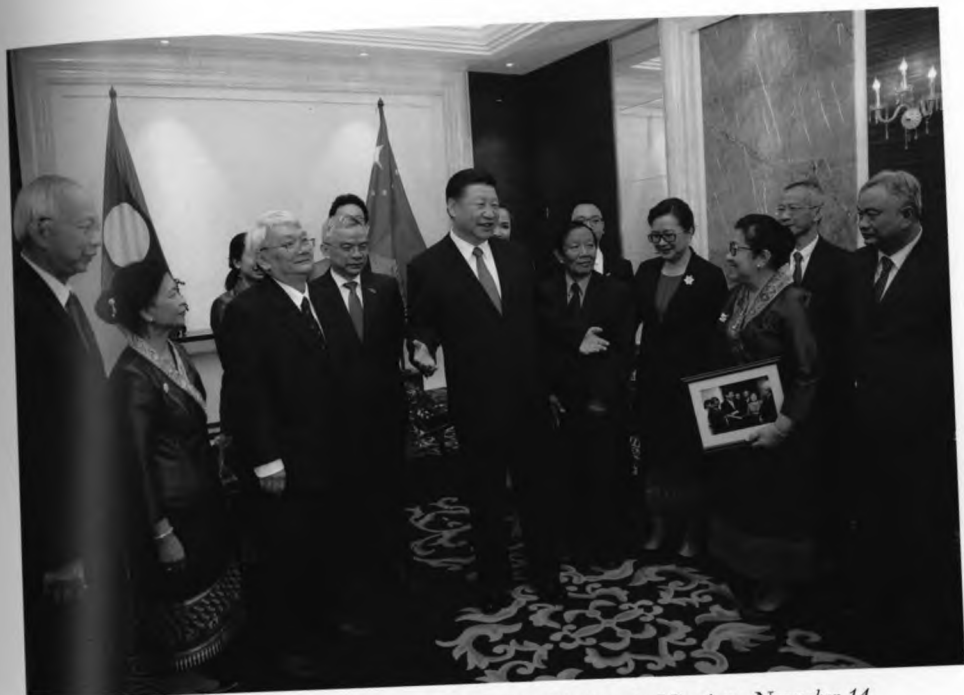
Meeting with relatives of late Lao leader Quinim Pholsena in Vientiane, November 14, 2017, during his state visit to Laos.