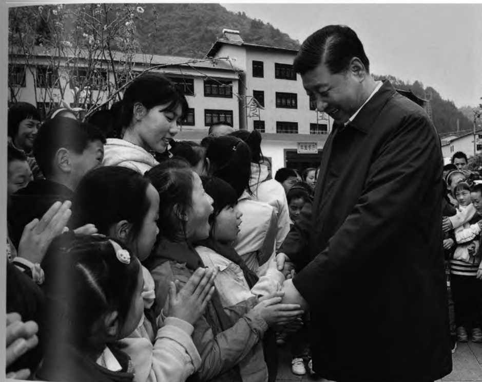
At a primary school in Zhongyi Township of Shizhu Tujia Autonomous County, April 15, 2019. During an inspection tour to Chongqing from April 15 to 17, Xi presided over a seminar on pressing problems related to the Two Assurances and Three Guarantees.