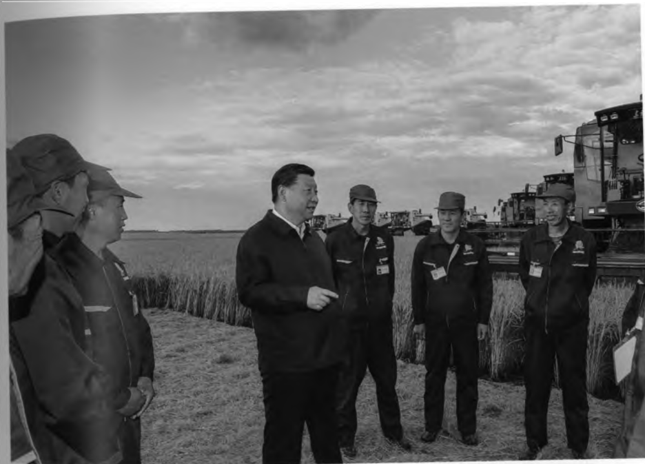
Chatting with workers at Qixing Farm in Jiansanjiang, an important grain production base in Heilongjiang Province, September 25, 2018. During his inspection tour to the provinces of Heilongjiang, Jilin and Liaoning from September 25 to 28, Xi chaired a meeting on the revitalization of northeast China.