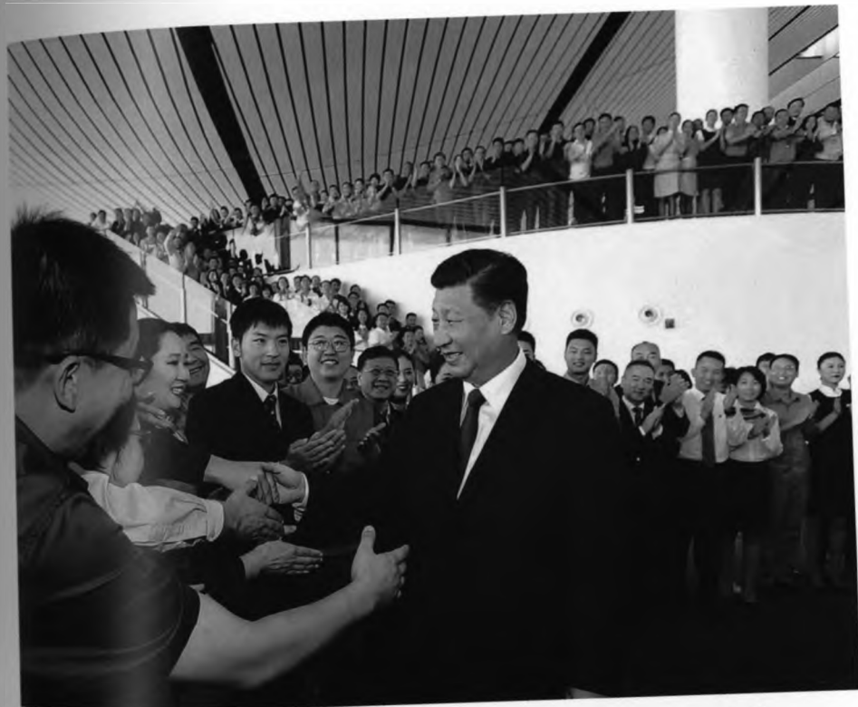
Greeting members of staff from the teams responsible for building and running Beijing Daxing International Airport, September 25, 2019. Xi announced the official opening of the airport at its launch ceremony, and inspected the terminals.