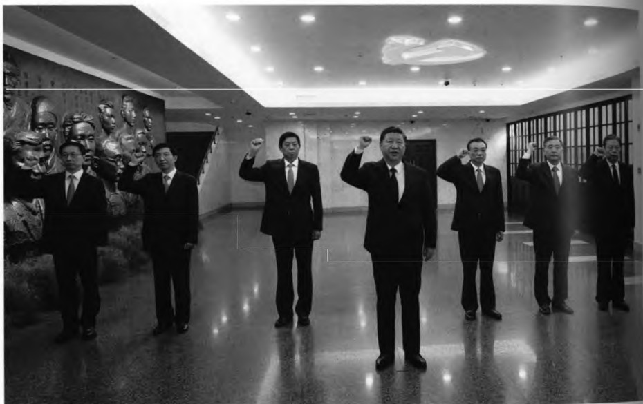
Rereading the oath of admission to the Party in Shanghai, October 31, 2017, along with other members of the Standing Committee of the Political Bureau of the 19th CPC Central Committee – Li Keqiang (3rd right), Li Zhanshu (3rd left), Wang Yang (2nd right), Wang Huning (2nd left), Zhao Leji (1st right), and Han Zheng (1st left) – at the site where the First CPC National Congress was held in 1921.