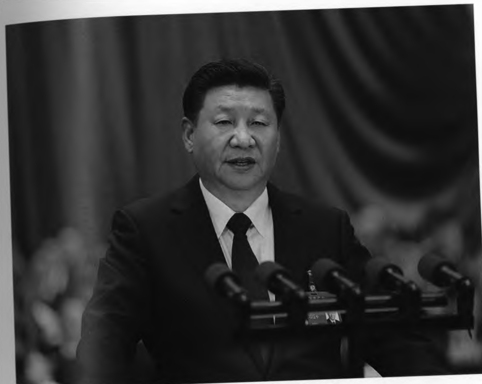
Making a report to the 19th CPC National Congress, October 18, 2017.

A weightlifter can lift only a 50-kg barbell at the beginning. But through proper training he may achieve as much as 250 kg. I believe that through my work, through the concerted effort of more than 1.3 billion Chinese, we can definitely take on this weighty responsibility and build our country well. In this I am fully confident; the Chinese people are fully confident.