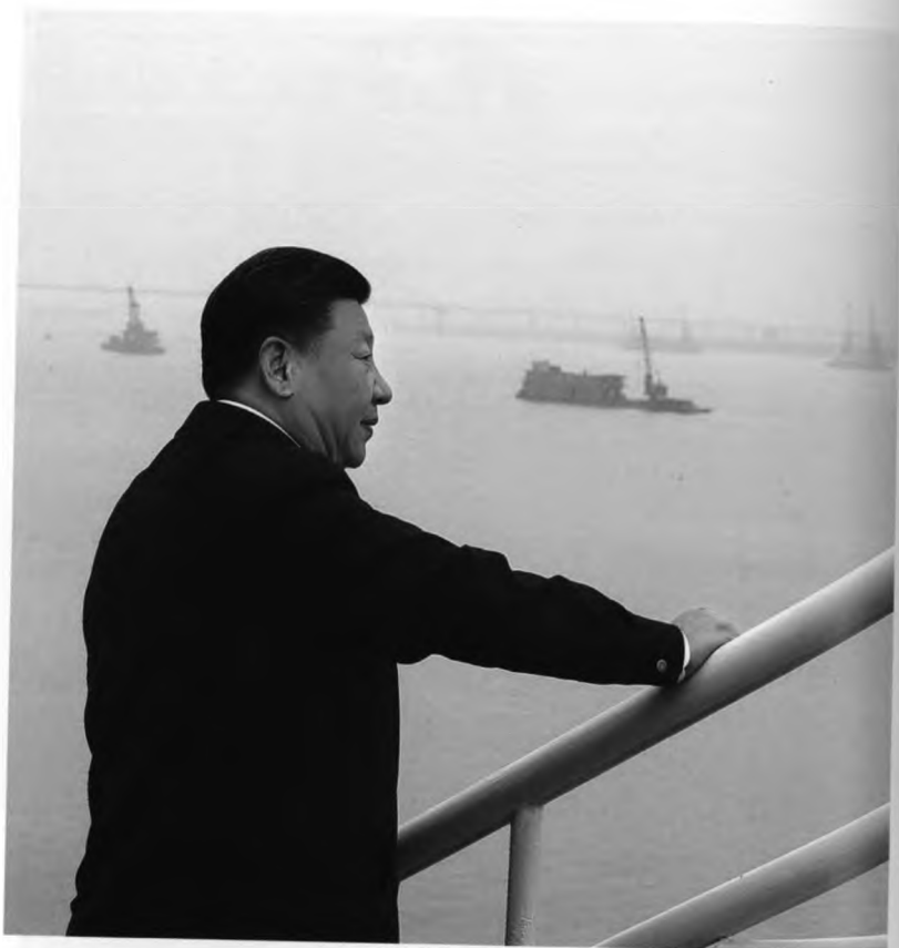
Inspecting the Chenglingji Hydrological Station in Yueyang, Hunan Province, April 25, 2018. Xi chaired a forum on further development of the Yangtze River Economic Belt in Wuhan, Hubei Province the following day.