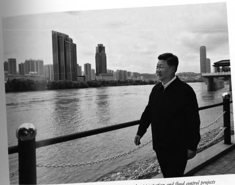
Visiting a Yellow River management point to learn about protection and flood control projects on the river in Lanzhou, Gansu Province, August 21, 2019.