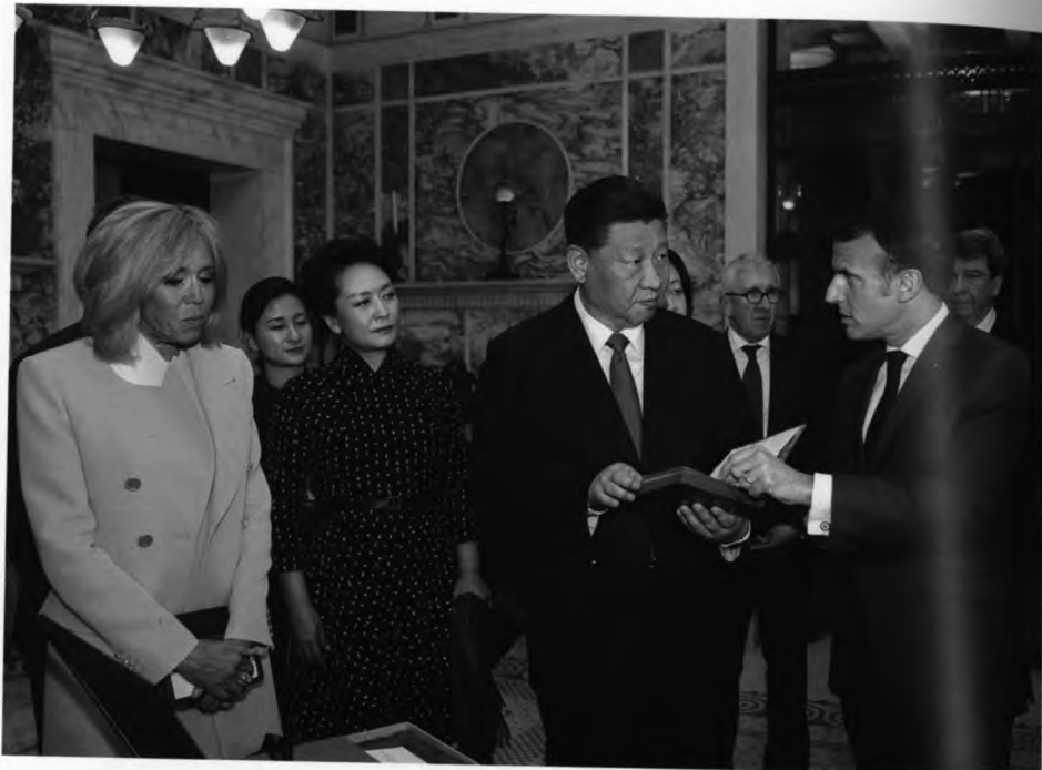
Receiving a first French translation of The Analects of Confucius, published in 1688, offered by French President Emmanuel Macron as a gift, prior to their official meeting in Nice, France, March 24, 2019.