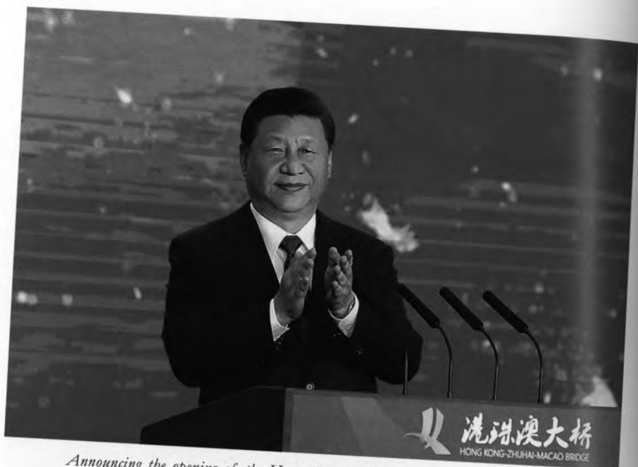
Announcing the opening of the Hong Kong-Zhuhai-Macao Bridge in Zhuhai, Guangdong Province, October 23, 2018.