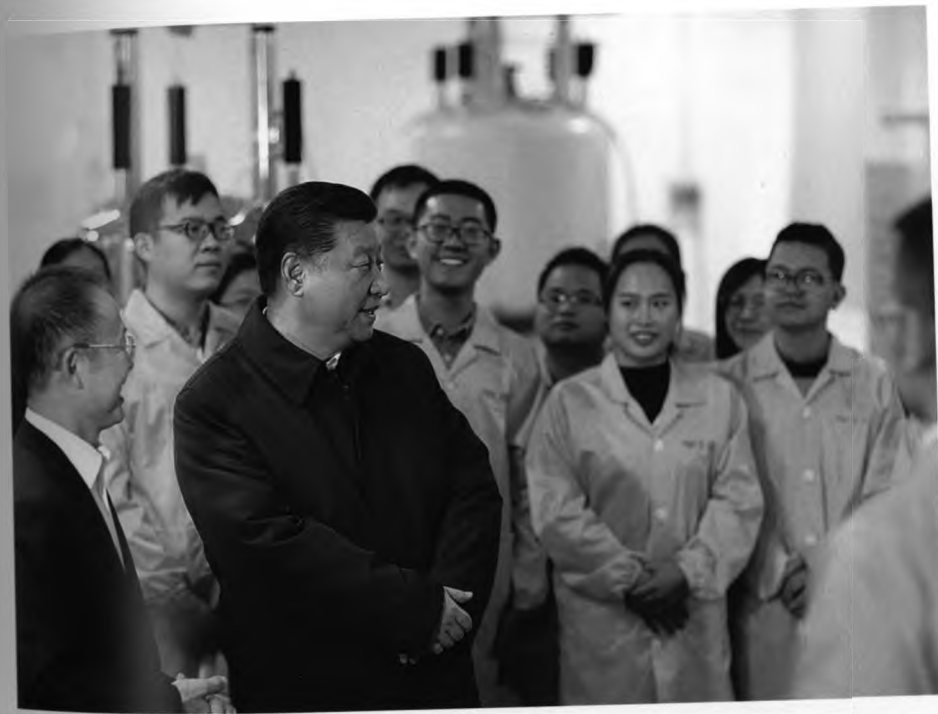
With teachers and students at the State Key Laboratory of Elemento-organic Chemistry in Nankai University, Tianjin, January 17, 2019.