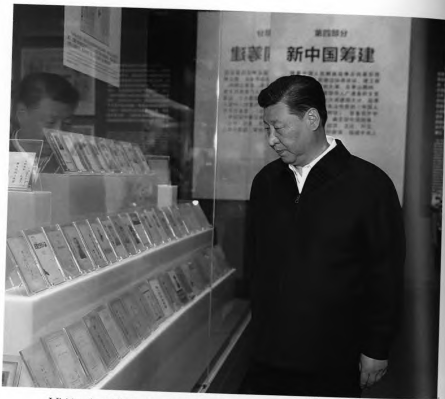
Visiting the exhibition "Laying the Foundation for the People's Republic of China" at a revolutionary memorial site in the Fragrant Hills in suburban Beijing, September 12, 2019.