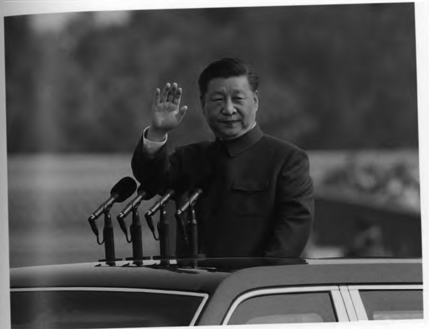
Reviewing the armed forces during the celebrations to mark the 70th anniversary of the founding of the People's Republic of China on Tian'anmen Square in Beijing, October 1, 2019.