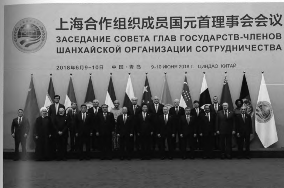
With other leaders attending the Qingdao Summit of the Shanghai Cooperation Organization, June 10, 2018. Xi chaired and addressed the 18th Meeting of the Council of Heads of Member States of the SCO.