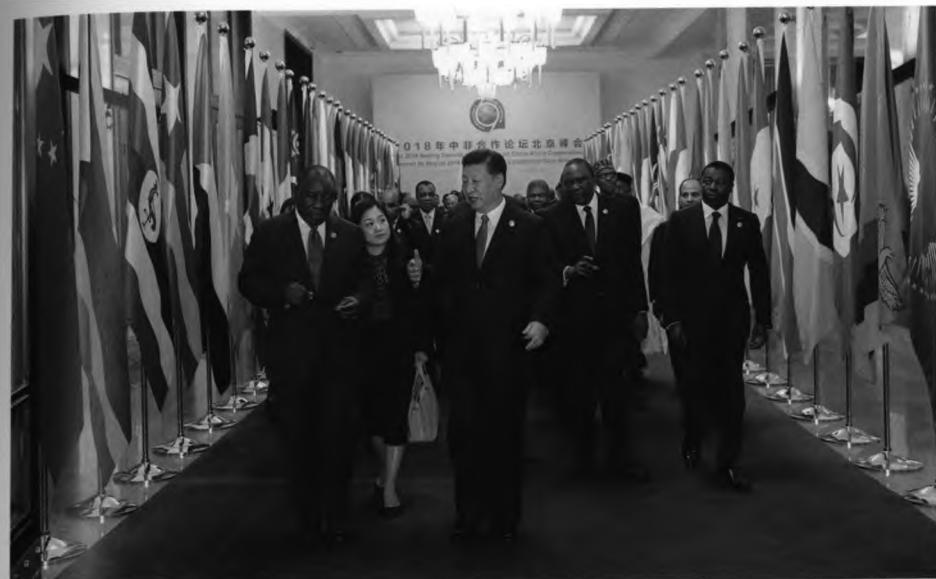
Together with foreign leaders on their way to the opening ceremony of the Beijing Summit of the Forum on China-Africa Cooperation in the Great Hall of the People, September 3, 2018. Xi gave a keynote speech at the ceremony.