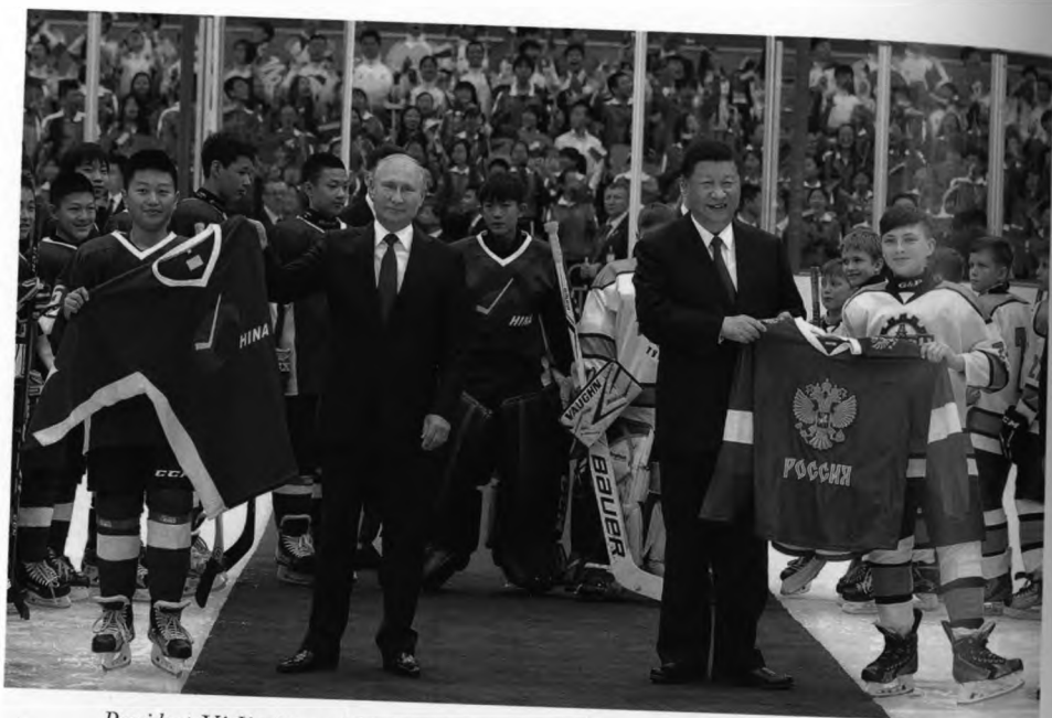
President Xi Jinping and his Russian counterpart Vladimir Putin receiving jerseys from players before a friendly match between the youth ice hockey teams of China and Russia in Tianjin, June 8, 2018.