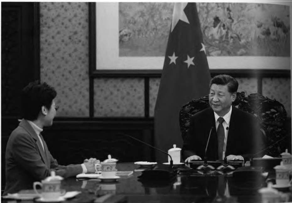
Meeting with Lam Cheng Yuet-ngor, chief executive of the Hong Kong Special Administrative Region, on her visit to Beijing to deliver her annual work report at Zhongnanhai, December 16, 2019.