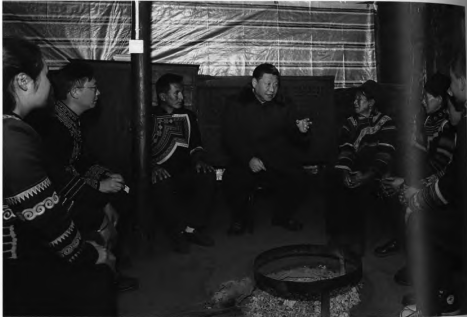
Chatting with village representatives and resident working team members on targeted measures to eradicate poverty around the fire pit in a villager's home in Sanbe Village, Liangshan Yi Autonomous Prefecture, Sichuan Province, February 11, 2018. The following day Xi presided over the Seminar on Targeted Poverty Elimination in the provincial capital Chengdu.