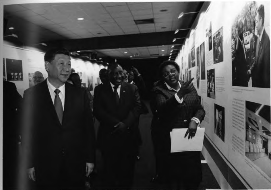
With South African President Cyril Ramaphosa at an exhibition of China-South Africa cooperation in scientific and technological innovation, prior to the opening ceremony of a high-level dialogue between Chinese and South African scientists in Pretoria, July 24, 2018.