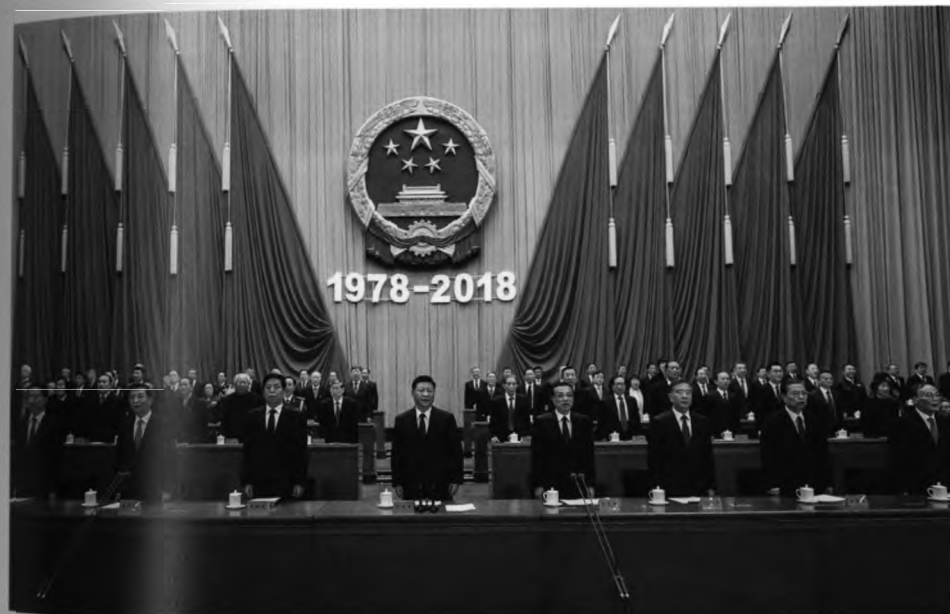
At the conference celebrating the 40th anniversary of China's launch of reform and opening up in the Great Hall of the People, Beijing, December 18, 2018, along with Li Keqiang (4th right), Li Zhanshu (3rd left), Wang Yang (3rd right), Wang Huning (2nd left), Zhao Leji (2nd right), Han Zheng (1st left), and Wang Qishan (1st right).