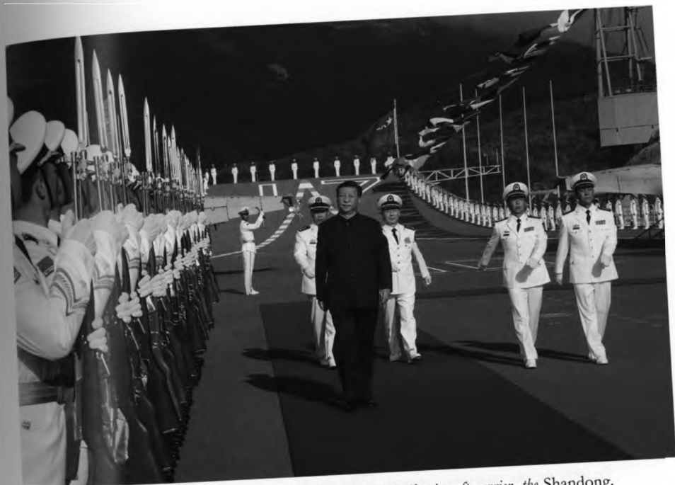
Reviewing the guard of honor on China's first home-built aircraft carrier, the Shandong, after its commissioning ceremony in Sanya, Hainan Province, December 17, 2019.