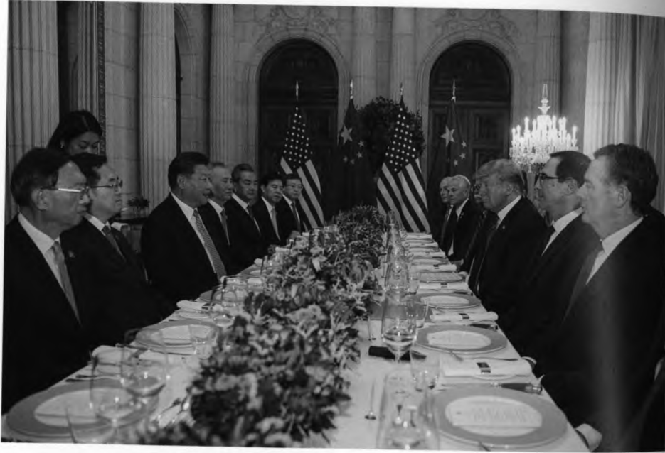
At a dinner with US President Donald Trump during the 13th G20 Summit in Buenos Aires, December 1, 2018.