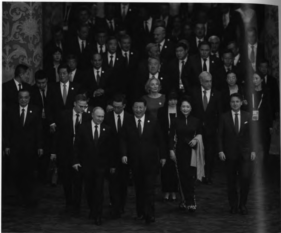
Xi and his wife, Peng Liyuan, held a banquet in the Great Hall of the People to welcome foreign leaders and their spouses and other guests attending the Second Belt and Road Forum for International Cooperation in Beijing, April 26, 2019.