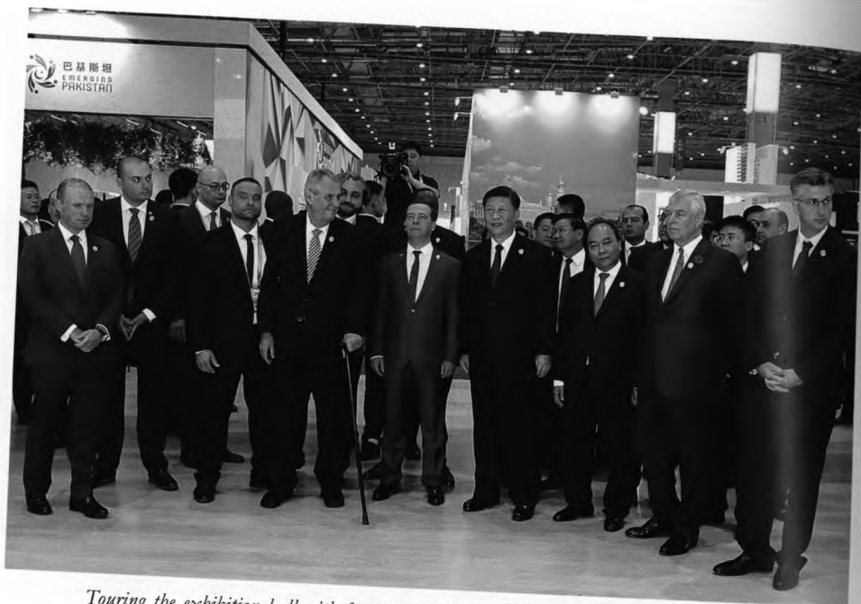
Touring the exhibition hall with foreign leaders attending the First China International Import Expo in Shanghai, November 5, 2018.